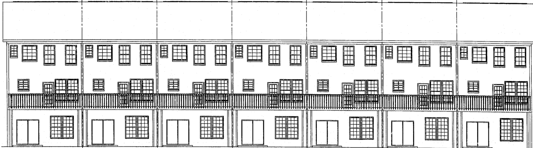
REAR ELEVATIONS 1/8" = 1'-0"