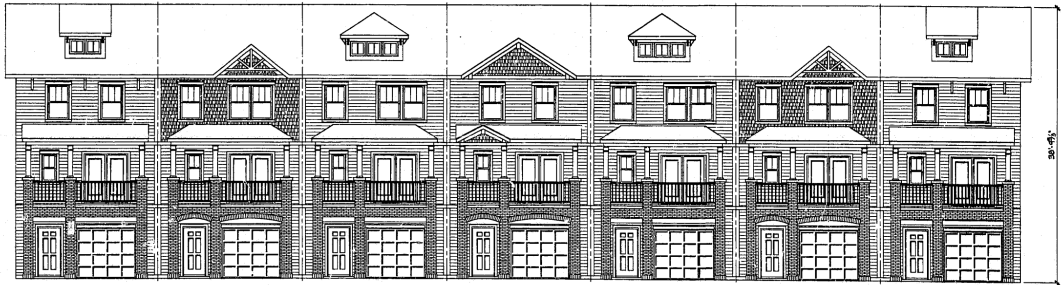
1806 ELEVATION A 1/8" = 1'-0" 1806 ELEVATION G 1/8" = 1'-0" 1806 ELEVATION B 1/8" = 1'-0" 1806 ELEVATION D 1/8" = 1'-0" 1806 ELEVATION E 1/8" = 1'-0" 1806 ELEVATION C 1/8" = 1'-0" 1806 ELEVATION A 1/8" = 1'-0"