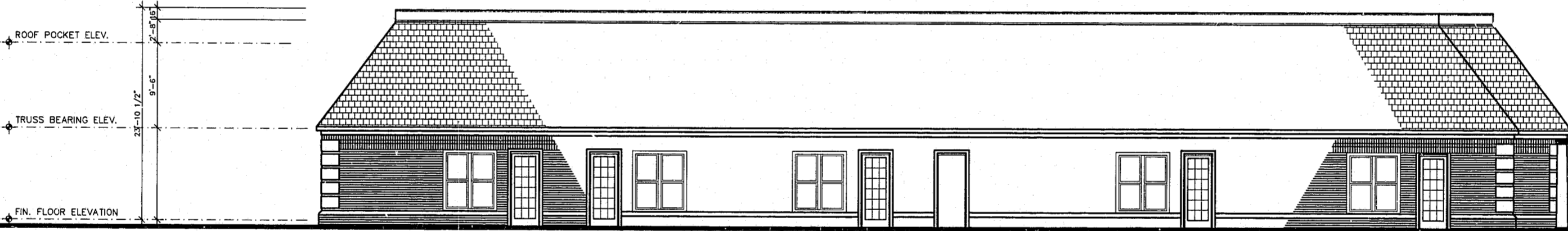
A4.03 ELEVATION SCALE 1/8" = 1'-0"