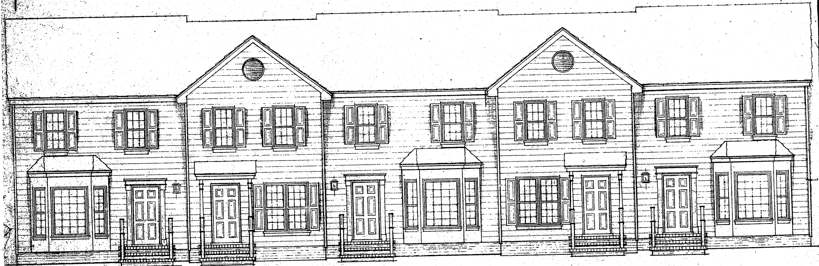
FRONT ELEVATION - 5 UNIT