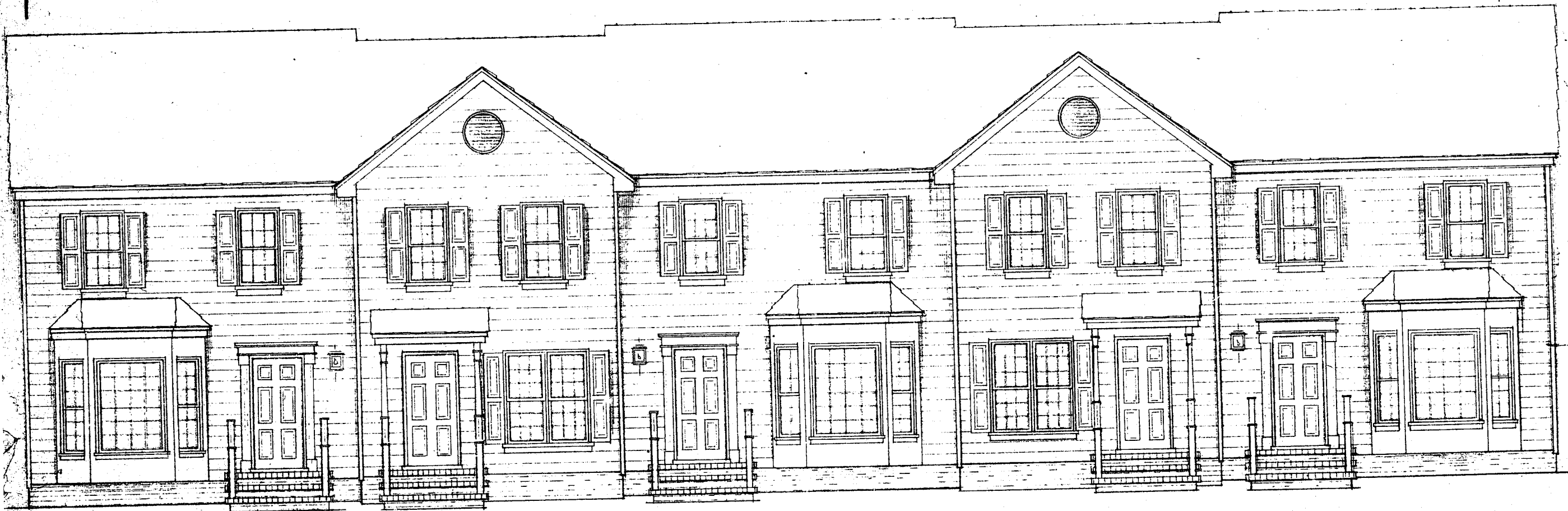
FRONT ELEVATION - SUIT