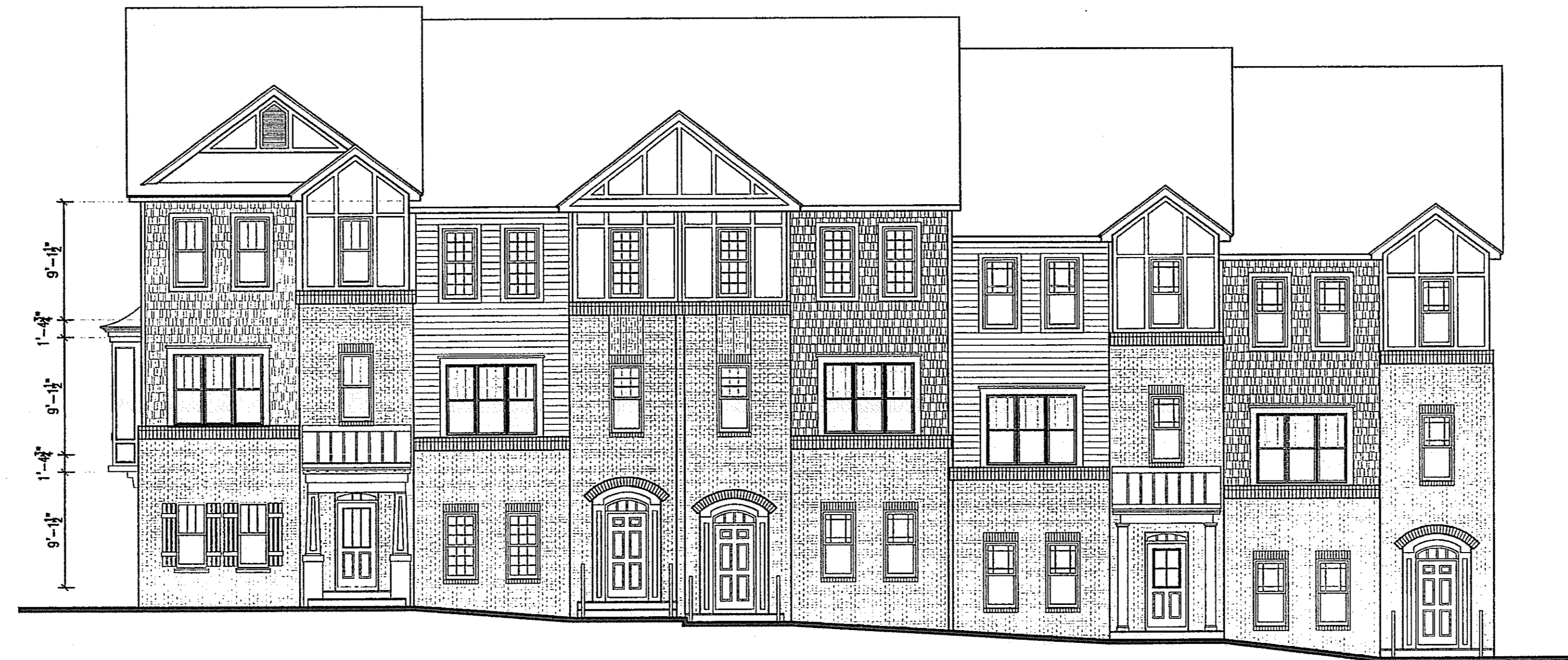
BUILDING 7 - FRONT ELEVATION SCALE: 1/8" = 1'-0"