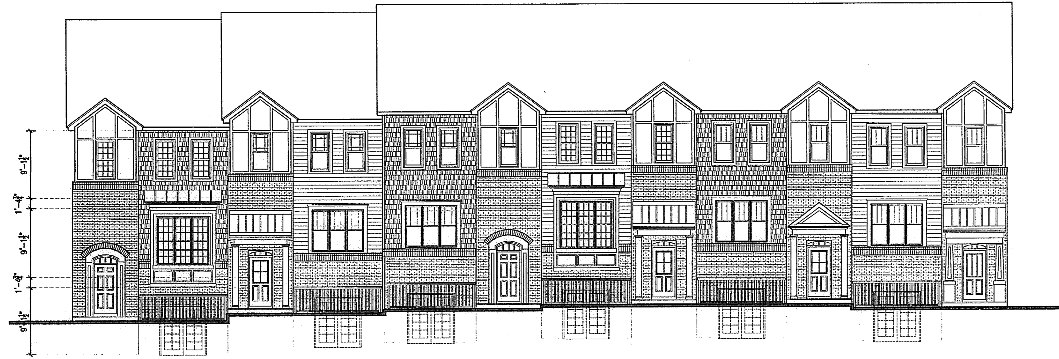
BUILDING 8 - FRONT ELEVATION SCALE: 1/8" = 1'-0"