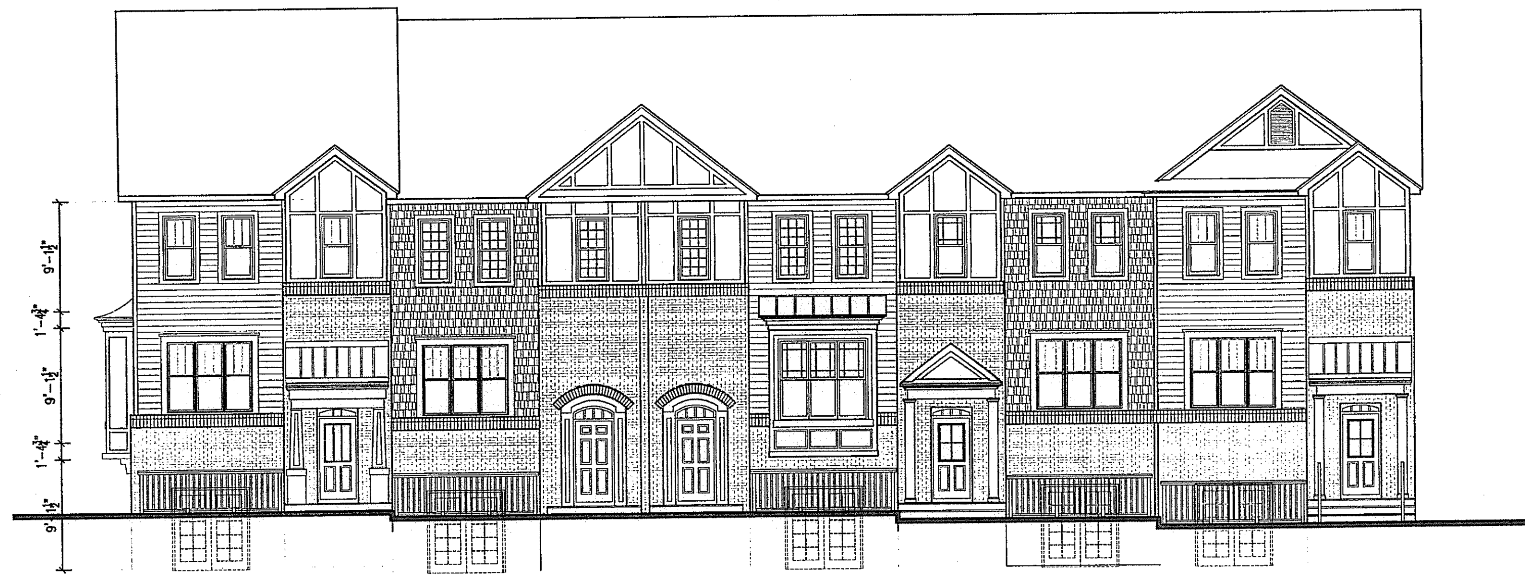
BUILDING 14 - FRONT ELEVATION SCALE: 1/8" = 1'-0"