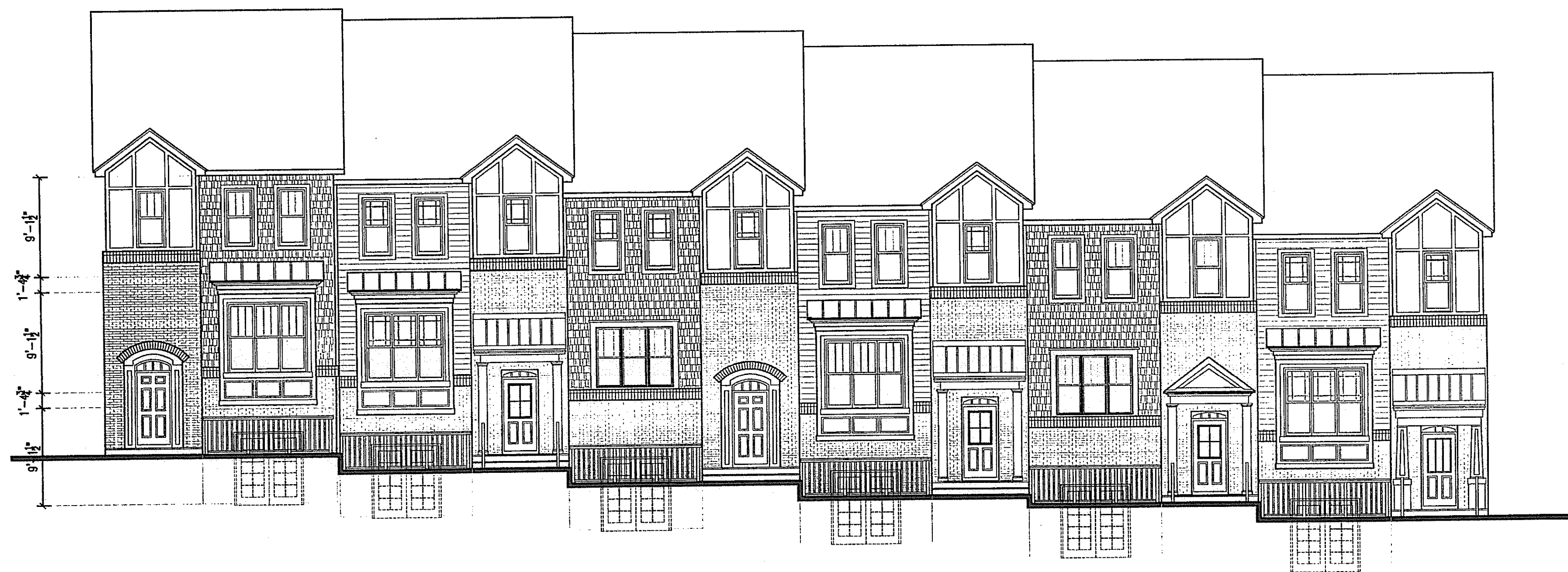
BUILDING 13 - FRONT ELEVATION SCALE: 1/8" = 1'-0"