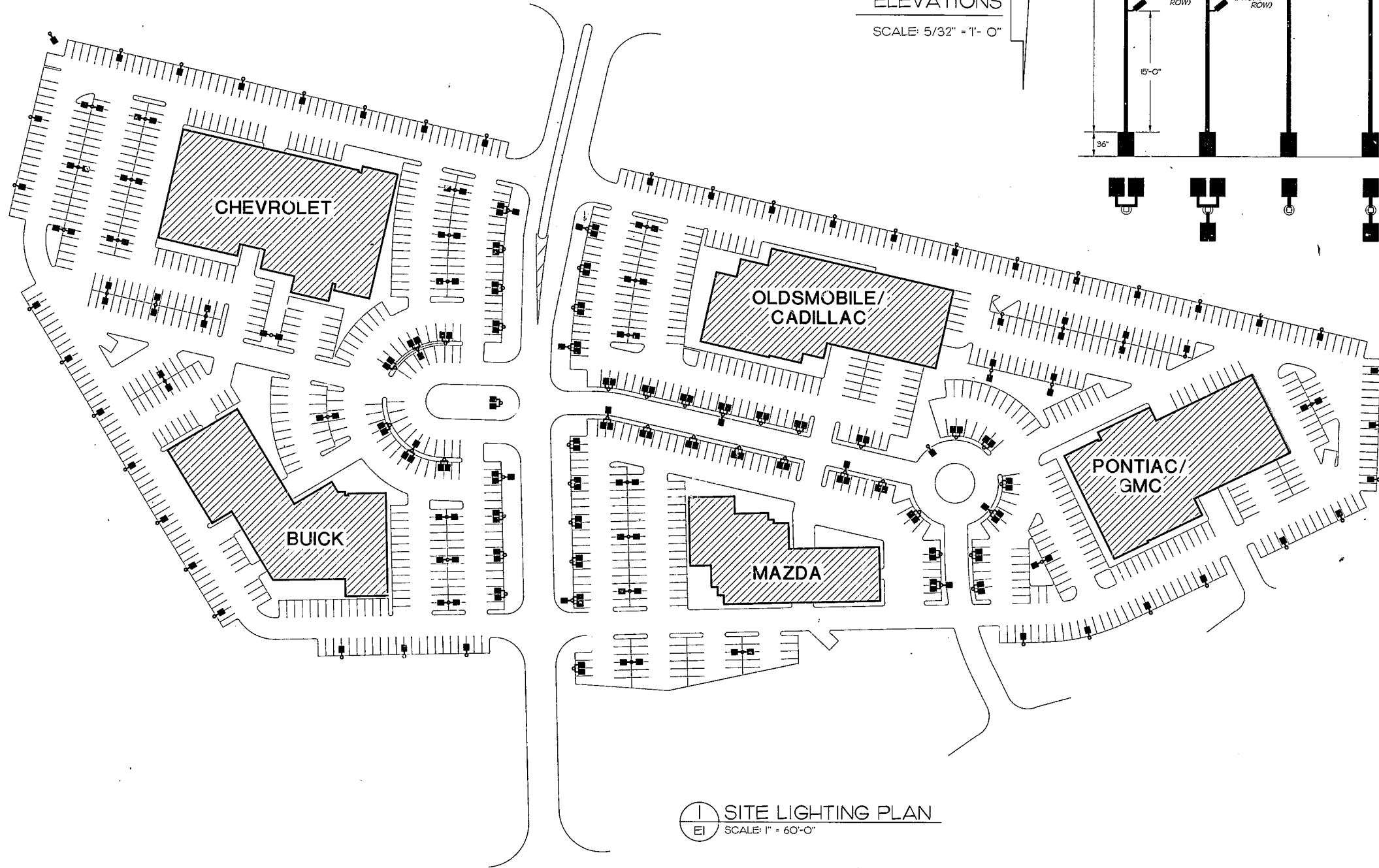
SITE LIGHTING EQUIPMENT LEGEND/ ELEVATIONS SCALE: 5/32" = 1'-0"