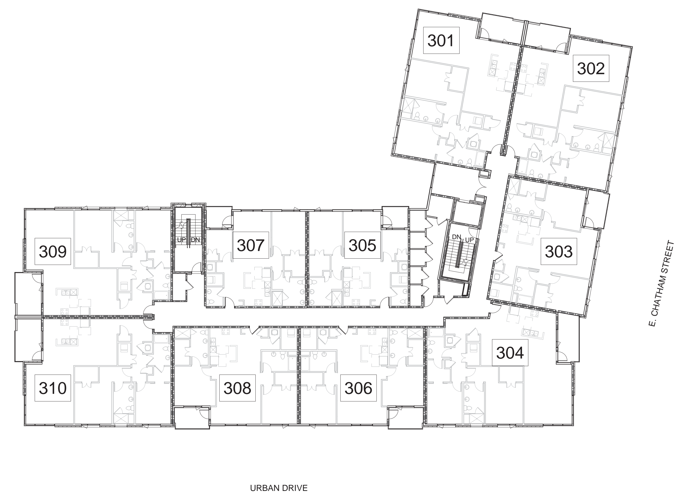
3RD FLOOR - ADDRESSING PLAN 3 1/16" = 1'-0"