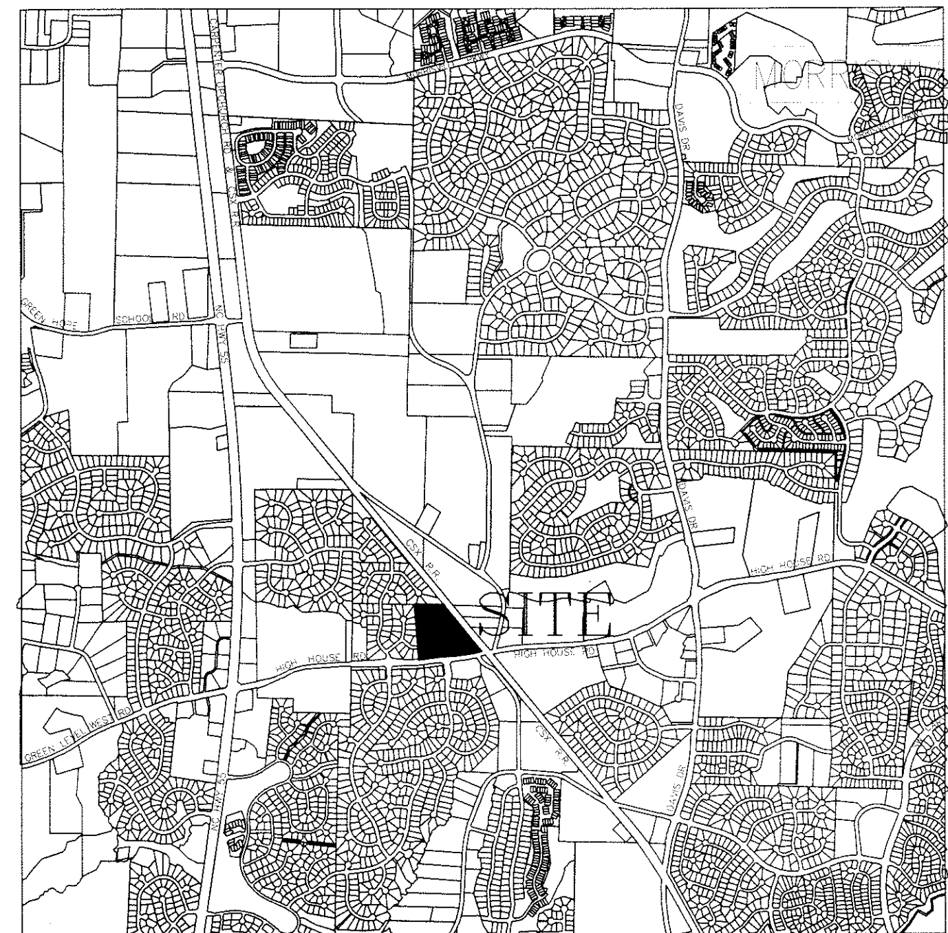
VICINITY MAP 1" = 2000'