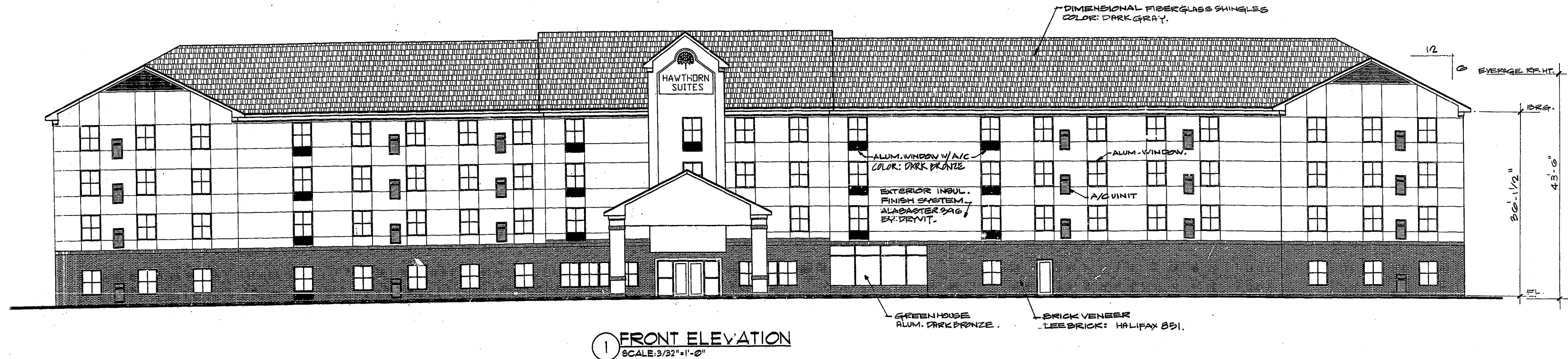
1 FRONT ELEVATION SCALE: 3/32" = 1'-0"