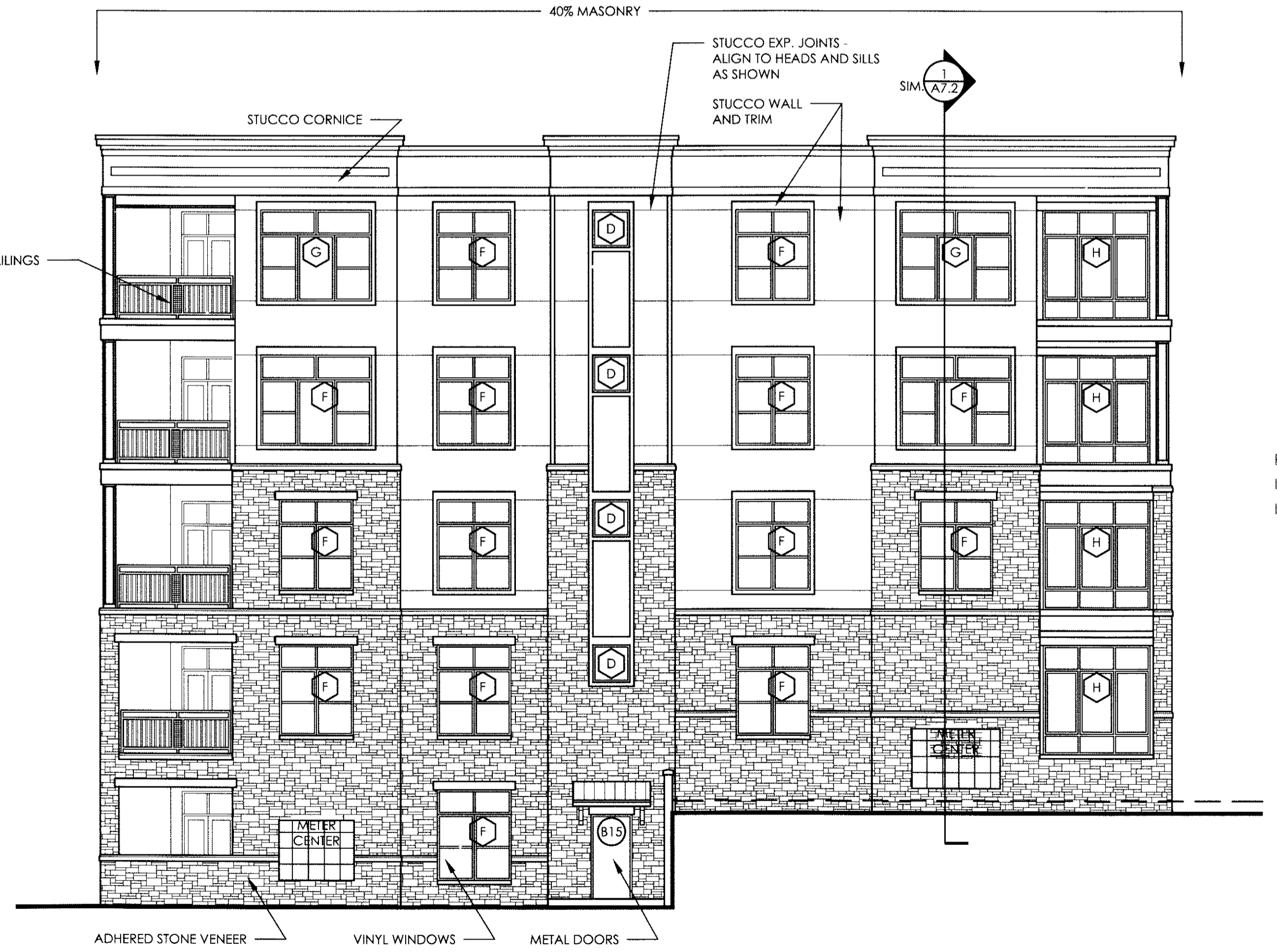
1 BLDG 1 - SIDE ELEVATION 1/8" = 1'-0"

11-SP-037 HTE #: 12-0045 Approved by the Town of Cary Development Review Committee Planner: [Signature] Date: 11/16/2011