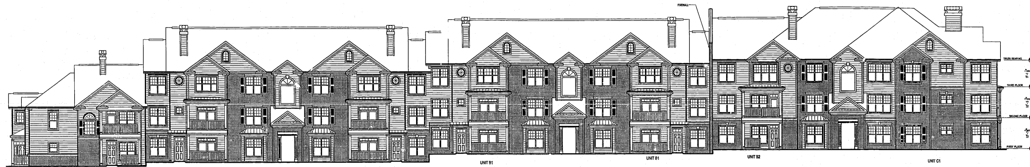
2 SOUTH ELEVATION - BLDG. 3 SCALE: 3/32"=1'-0"