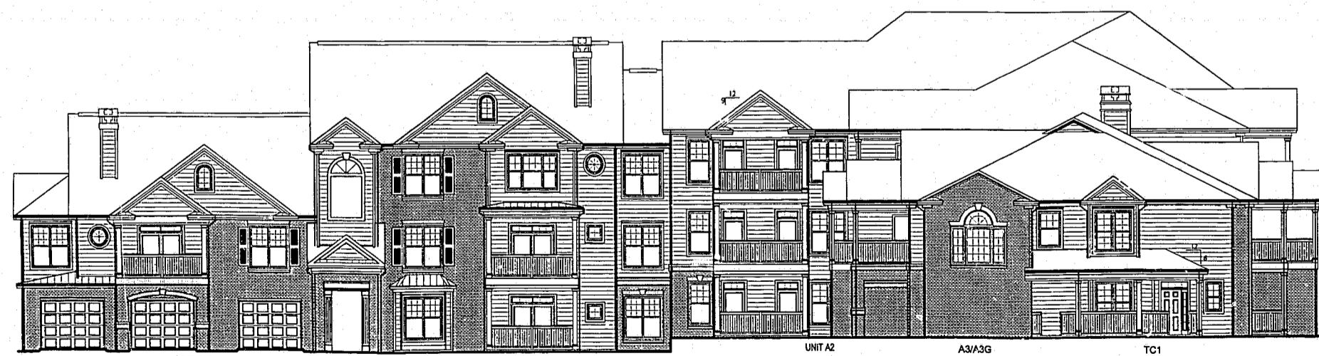
4 WEST ELEVATION - BLDG. 3 SCALE: 3/32"=1'-0"