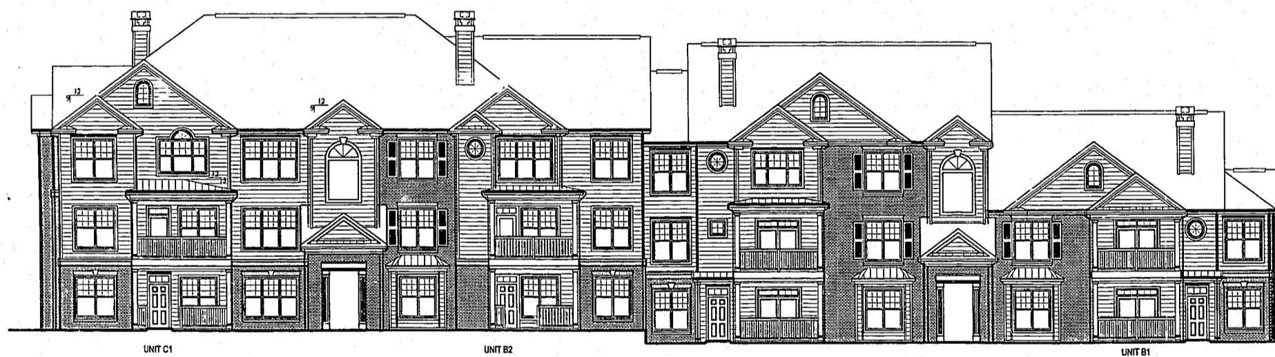
3 EAST ELEVATION - BLDG. 3 SCALE: 3/32"=1'-0"