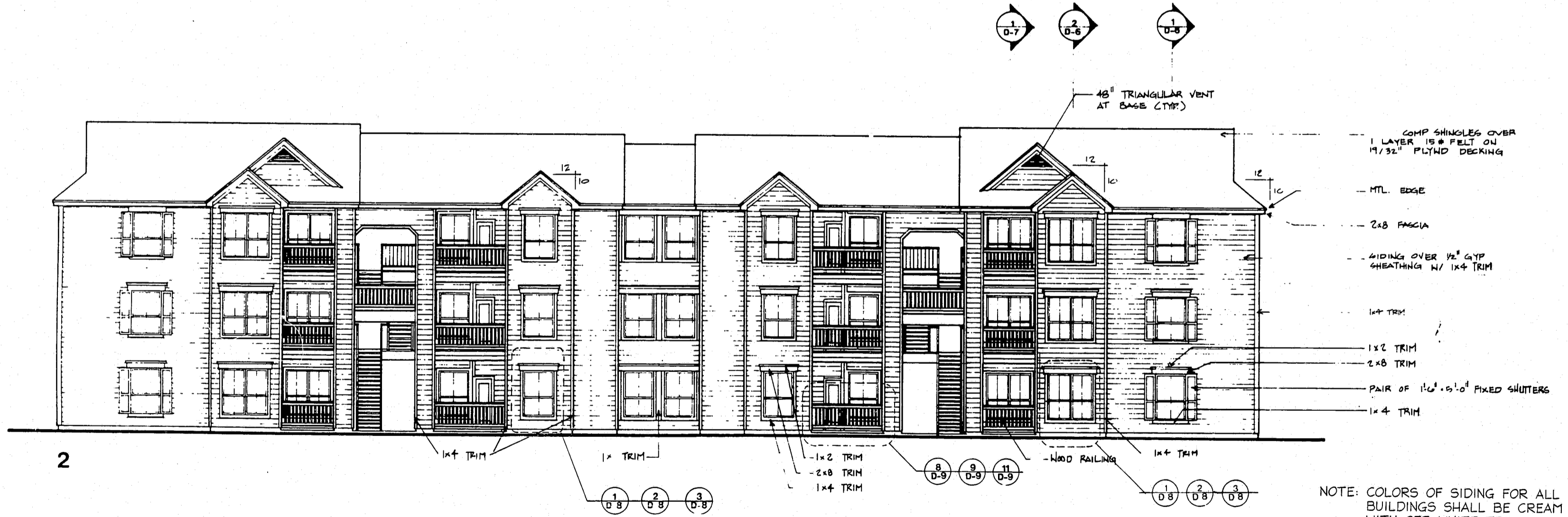
2 FRONT and REAR ELEVATION

NOTE: COLORS OF SIDING FOR ALL BUILDINGS SHALL BE CREAM WITH OFF-WHITE TRIM.