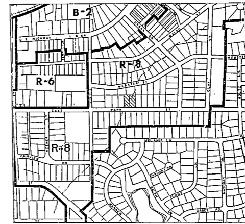
VICINITY MAP 1"=500'