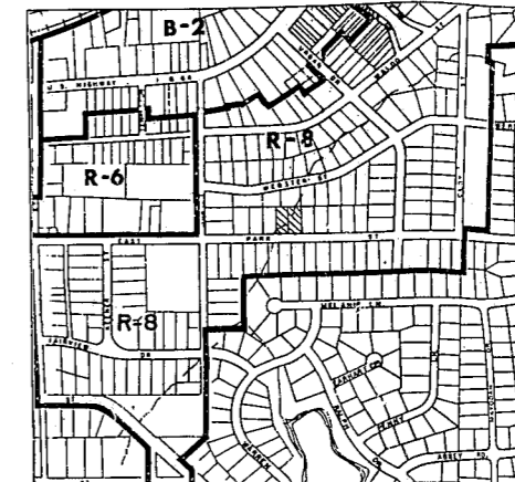
VICINITY MAP 1"=500'